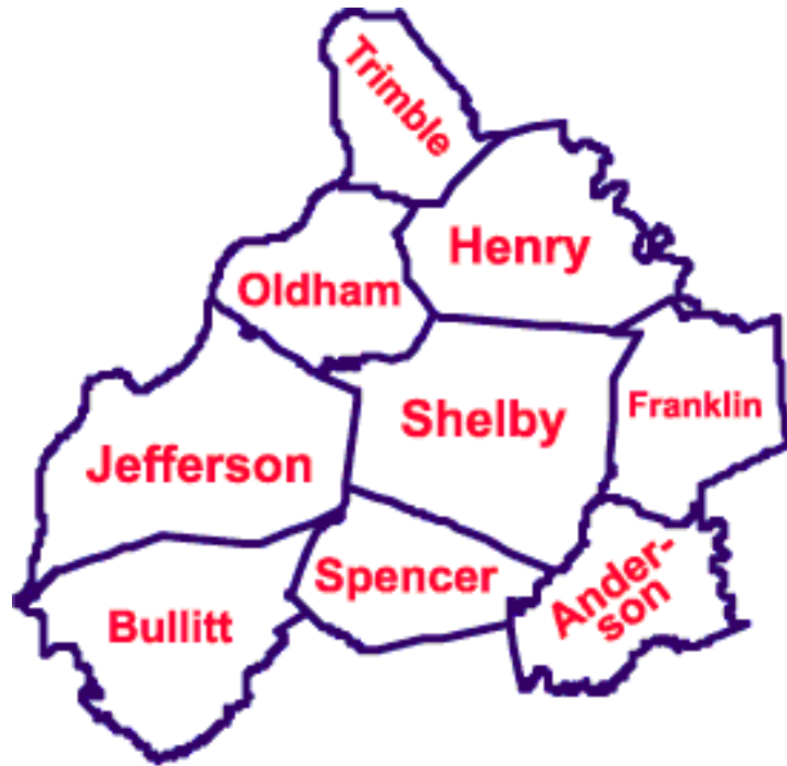
ARES District 6