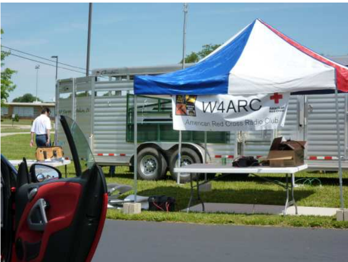
The W4ARC banner and RTTY station