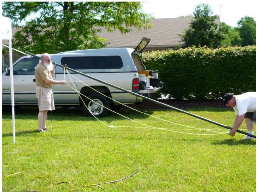
Michael KG4ZPZ and Roman KE6YCW work to get the 2 masts used for Field Day installed. Our location at the Red Cross building in Buckner provided good visibility and traffic from the major highways 393 and 146.